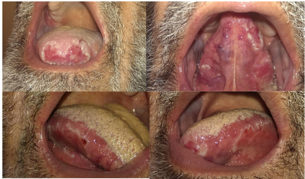
Figs. 1–4 Oral lesions associated with significant oral pain

and high dose Methotrexate). Post-chemotherapy of the WBC was <0.1 and ANC 0; he developed mucositis with primary involvement of the tongue while his mental status improved. Cidofovir swish was restarted but unfortunately the patient was transferred to ICU with sepsis, bacteremia, and fungemia on day +188. He was intubated and ventilated and eventually expired after terminal extubation on day +189.