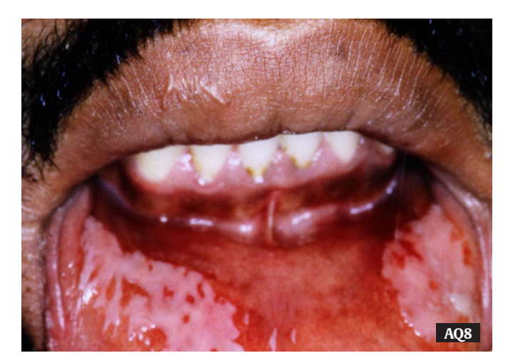
Figure 26.1 Mucositis.

severity of mucosal damage. Good oral hygiene, an atraumatic diet, and oral rinsing with saline are basic oral care recommendations. Food and Drug Administration—cleared devices for mucositis include coating agents such as sodium hyaluronate topical (Gelclair), XXX AQI (MuGard), and artificial saliva (Caphosol). Oral cooling with ice chips has been shown useful in short-acting, bolus chemotherapy, but not investigated in radiation therapy. Benzydamine (not available in the United States) has shown a preventive effect. Pain management should be provided as needed. Continuing studies provide reason for optimism for future advances in prevention and treatment of mucositis.<sup>2</sup>