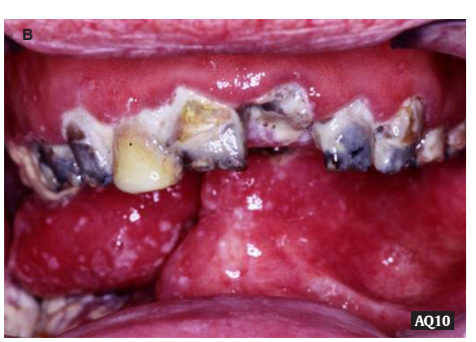
Figure 26.3 (A) Incipient radiation-induced dental caries. (B) Severe radiation-induced dental caries.