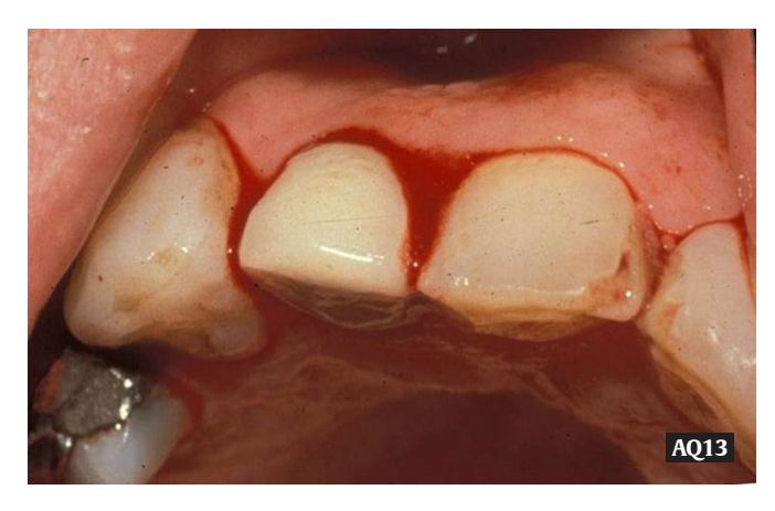
Figure 26.6 Gingival hemorrhage induced by chemotherapy and decreased platelet count.

bleeding occurs most commonly from the gingival sulcus ( Fig. 26.6 ). The epithelium is only a few cells thick, and it is not uncommon to have inflammation present because of gingival or periodontal disease that may be preexisting or may have developed as the result of the patient's compromised ability or desire to perform daily oral hygiene procedures.